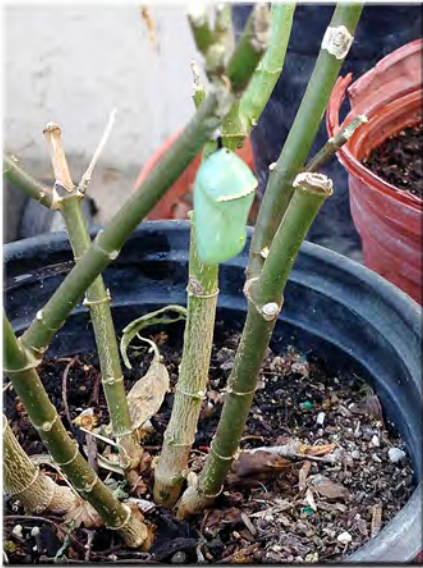
Monarch chrysalis attached to milkweed plant