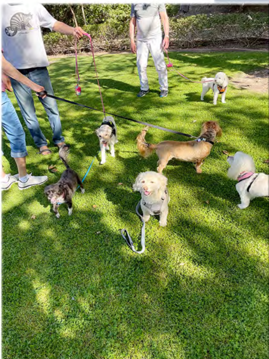
Pilcher Park Pack