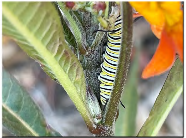
Young Monarch caterpillar on milkweed