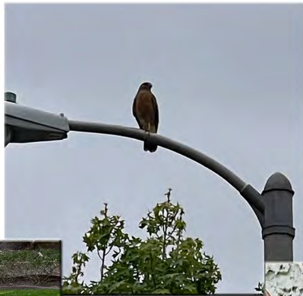
From Big Bird to tiny birds