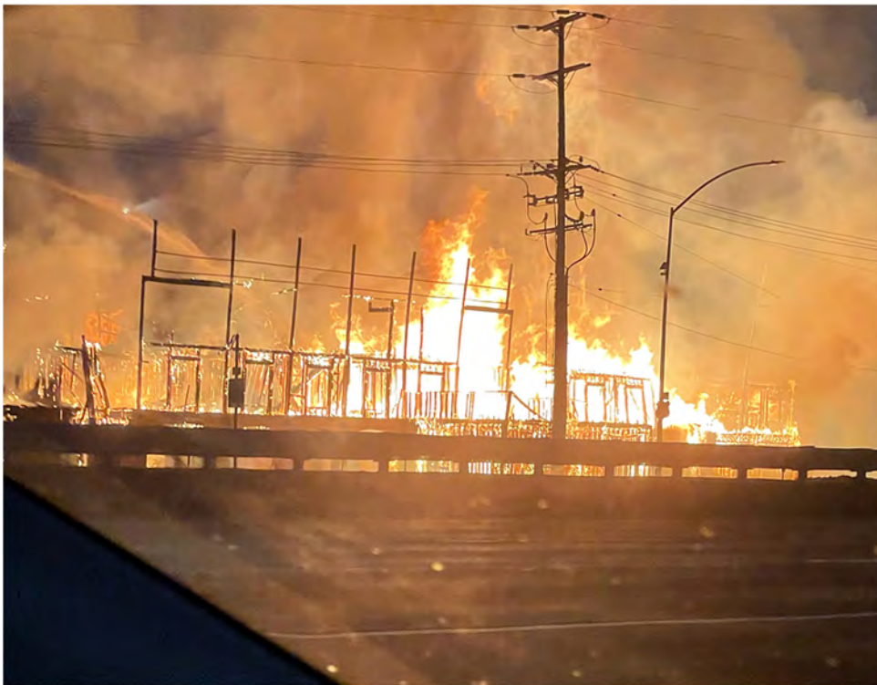
Photo of the recent fire at the hotel under construction across from Camarillo Outlets taken by Lorraine Villarreal.